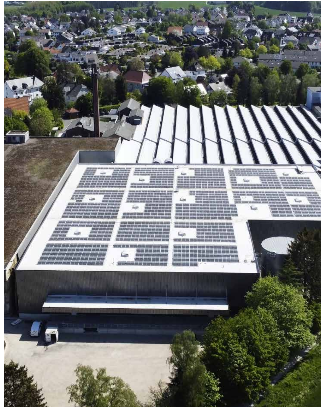
Photovoltaic system on new DELCOTEX hall in Jöllenbeck