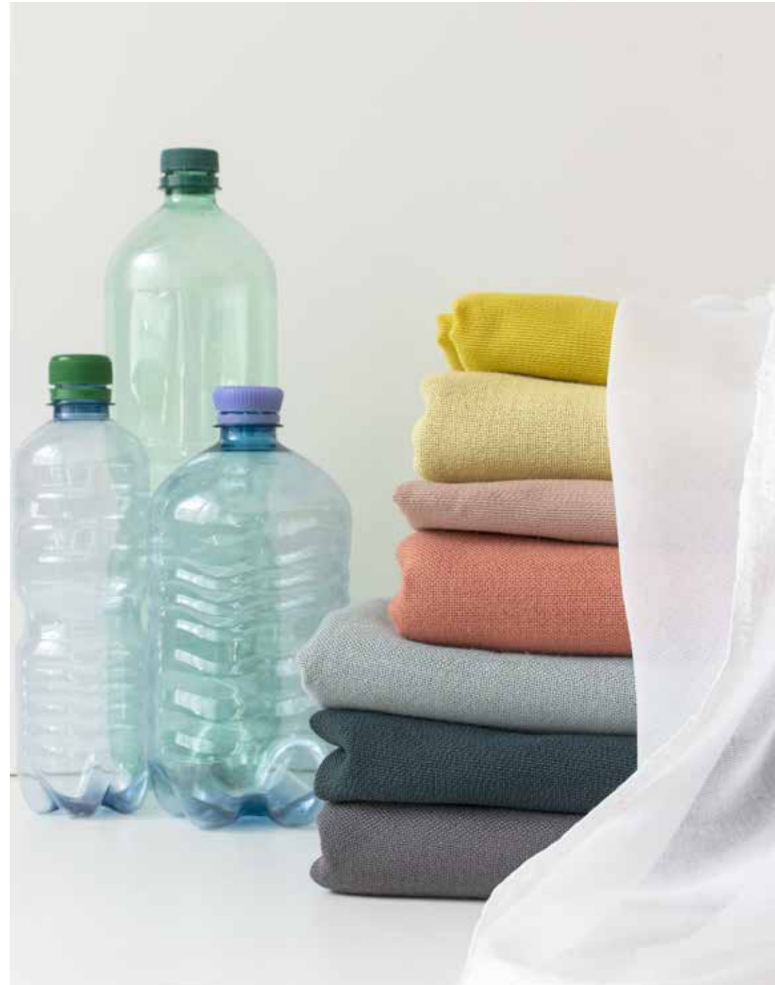
EcoLine curtain fabrics made from recycled PET bottles