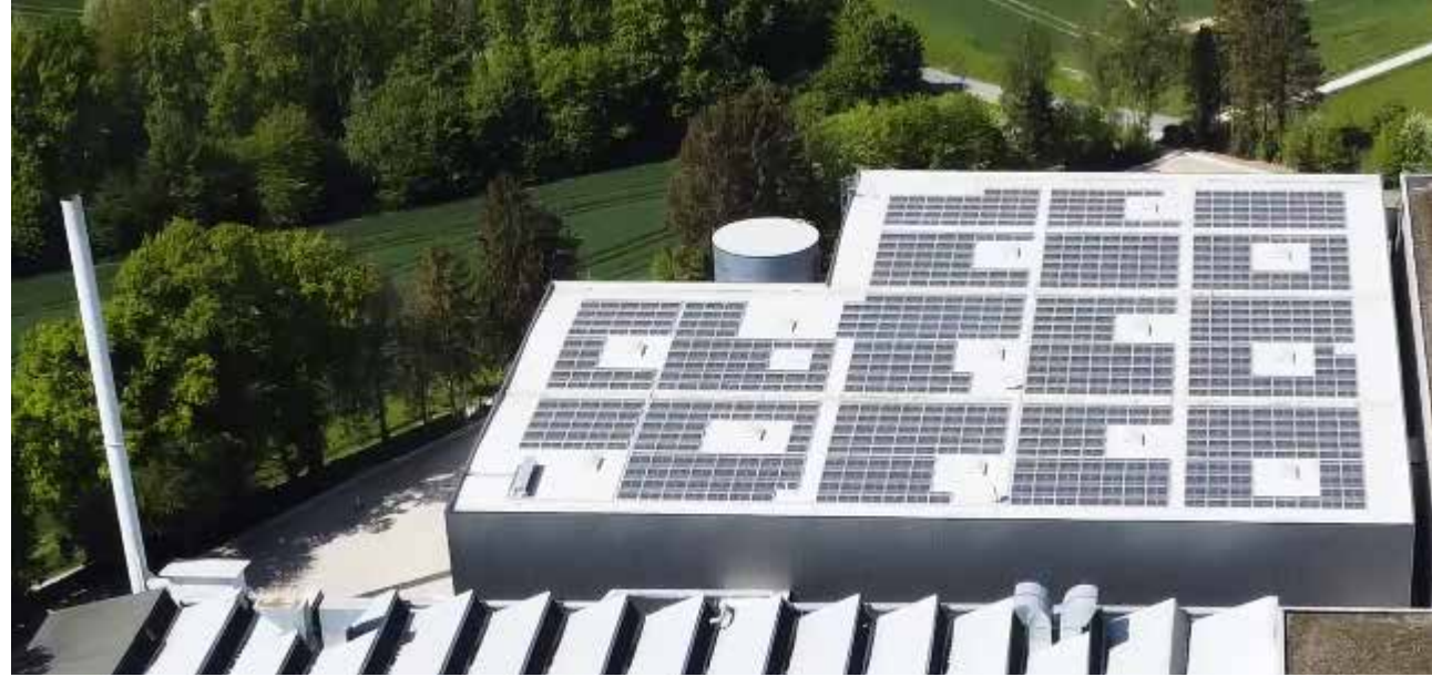
Photovoltaic system on new DELCOTEX hall in Jöllenbeck

Together with employees, managers and shareholders, we have reviewed and partially revised our values within the framework of the strategy development process for 2027, sustainability in particular is of fundamental importance for the long-term development of the group of companies.