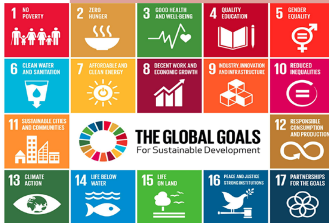
Global Goals for Sustainable Development der UN

We are guided by the 17 Global Goals for Sustainable Development of the United Nations: