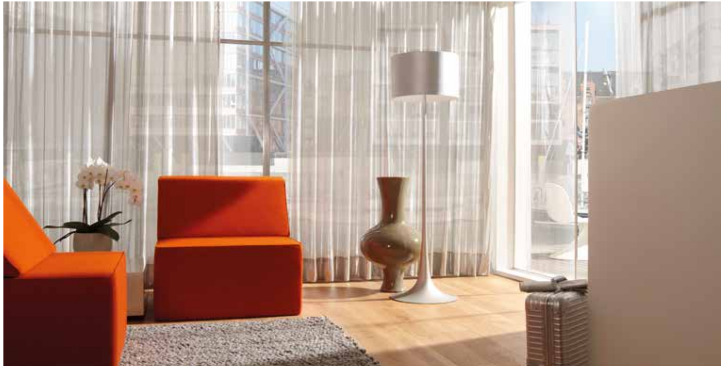
Energy-efficient DELITHERM curtain fabrics from DELIUS