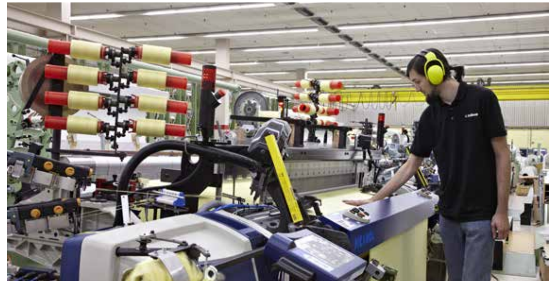
DELICOTEX weaving mill in Jöllenbeck

The DELIUS Group is committed to a healthy working environment within the framework of occupational health management (OHM), protects health and ensures occupational safety in order to prevent accidents and injuries.