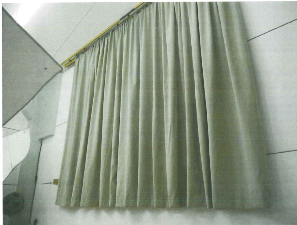
Figure B.2. Test arrangement in the reverberation room (diagonal view).