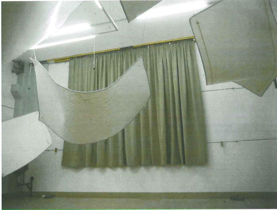
Figure B.1. Test arrangement in the reverberation room (total view).