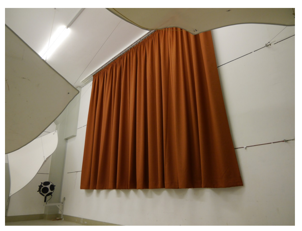
Figure B.2. Test arrangement in the reverberation room (diagonal view).