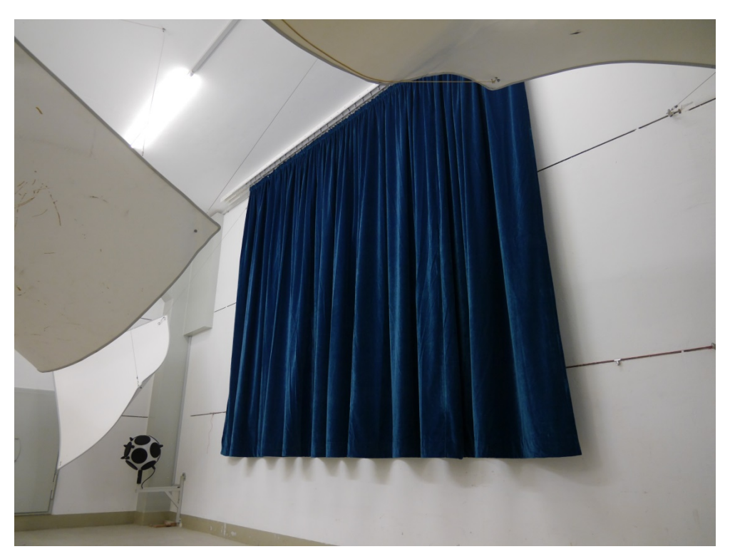
Figure B.2. Test arrangement in the reverberation room (diagonal view).