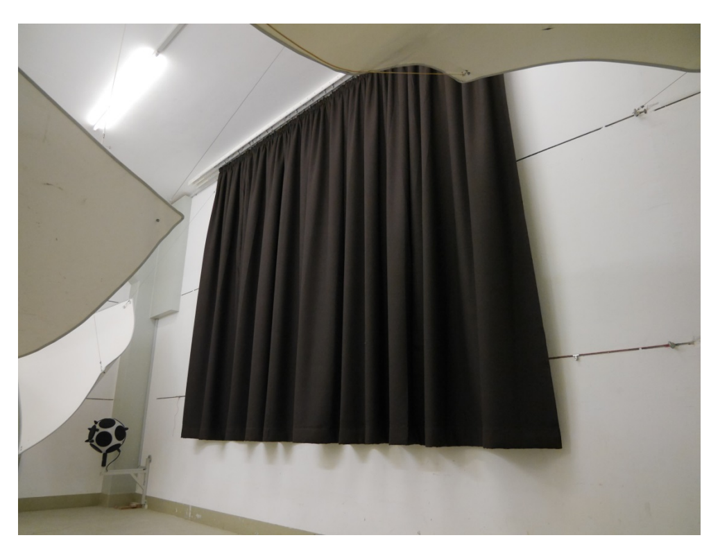
Figure B.2. Test arrangement in the reverberation room (diagonal view).