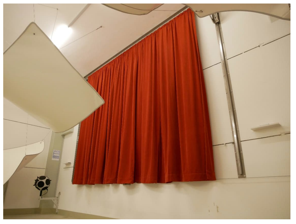
Figure B.2. Pleated hanging curtain in the reverberation room (diagonal view).