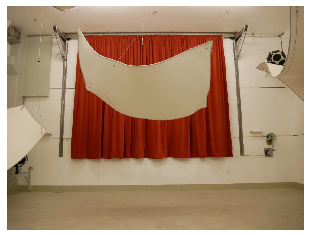
Figure B.1. Pleated hanging curtain in the reverberation room (frontal view).