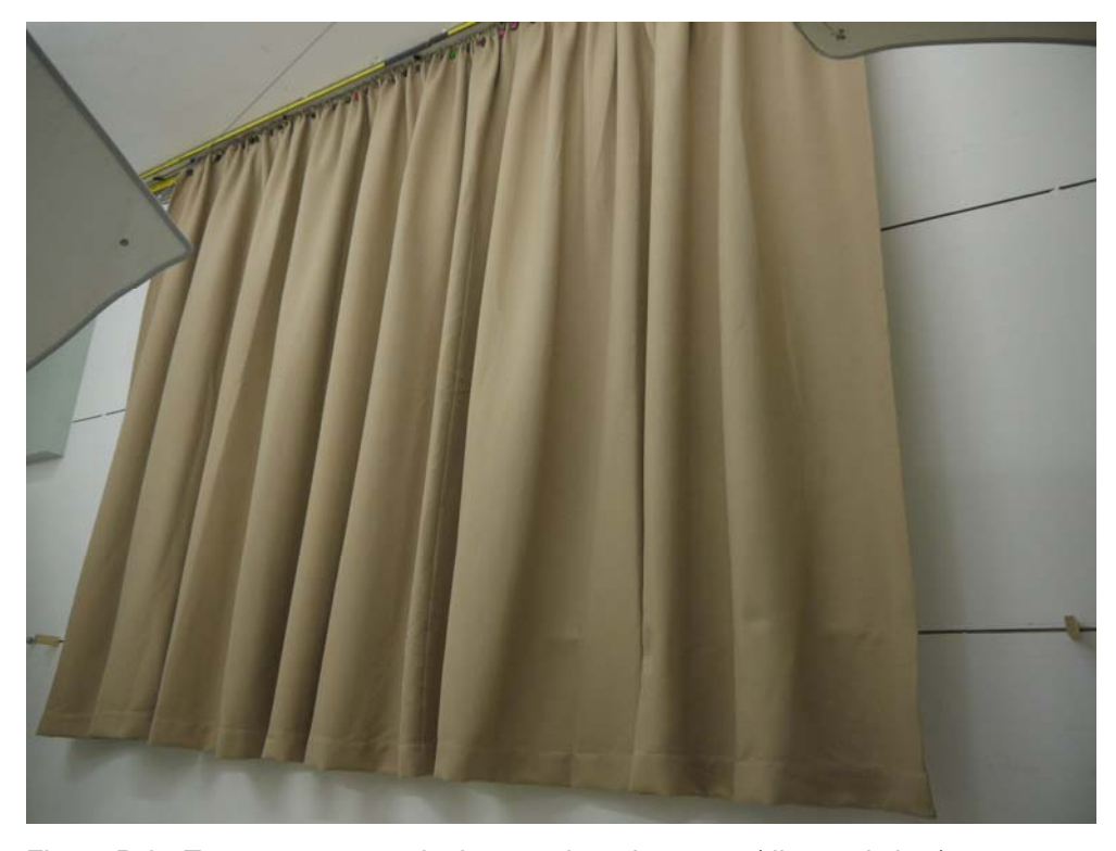
Figure B.2. Test arrangement in the reverberation room (diagonal view).